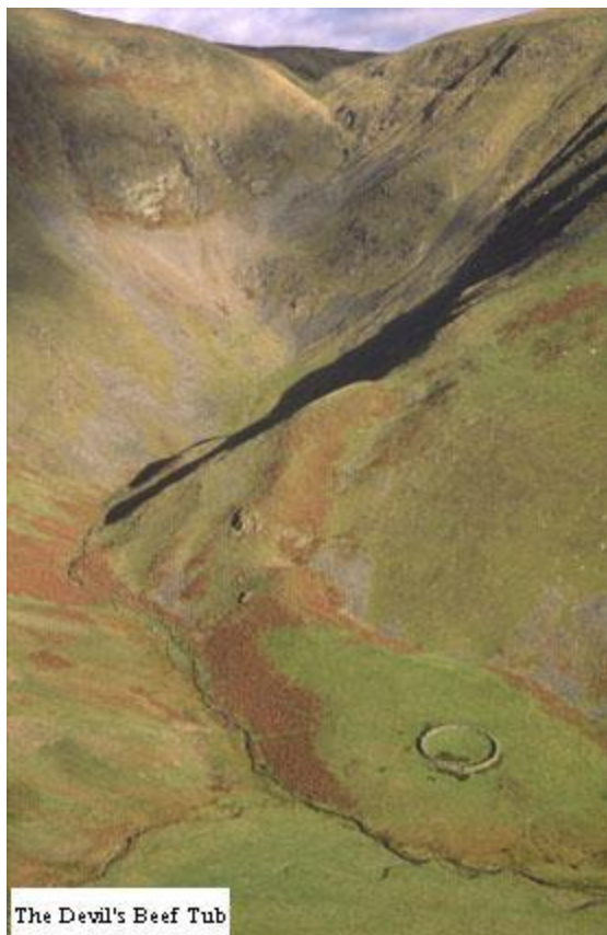
The Devil's Beef Tub

The River Annan has its source in an area of rugged hills some 6 miles north of the town of Moffat and its mouth 32 miles further down Annandale, where it empties into the Solway Firth. At the rivers source there is a remarkable, awesome hollow in the hills known as the "Devil's Beef Tub."